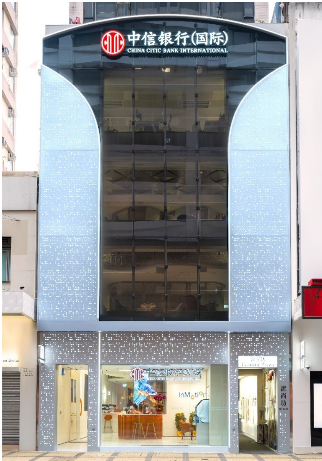
China CITIC Bank International's new ESG flagship branch in Tsim Sha Tsui is the first bank branch in Hong Kong to use solar glass panels on the bank branch external walls