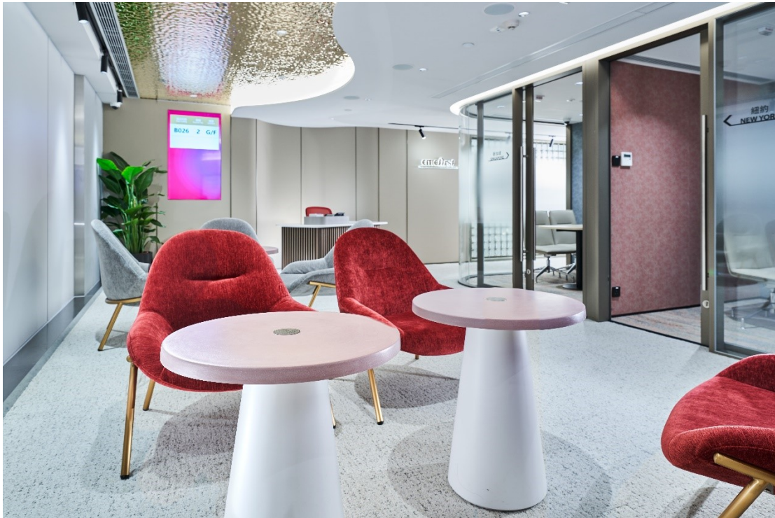
Tables in the meeting rooms of China CITIC Bank International's new ESG flagship branch in Tsim Sha Tsui are made of more than 30% eco-friendly chili leaves and chili seeds